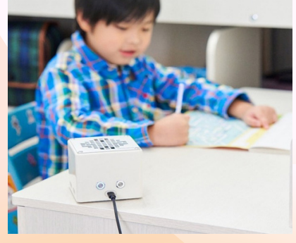
At study desk